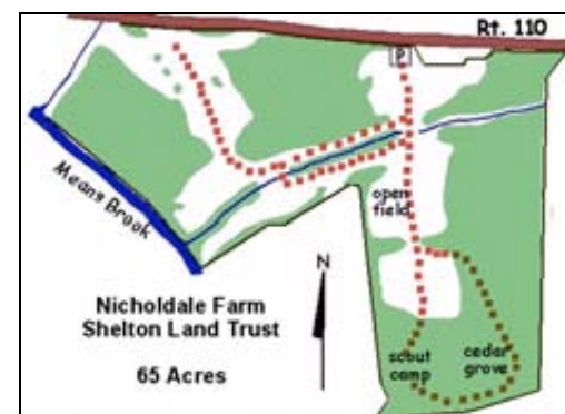
Map Courtesy of Teresa Gallagher

Located on Route 110 four miles north of downtown Shelton, Nicholdale Farm is the most accessible and developed property owned by the Shelton Land Conservation Trust. The public is encouraged to enjoy this 65 acre parcel of mixed hardwoods and open pasture. A developed system of trails suitable for hiking and cross country skiing, a scout camping and picnic area, and a small brook offer opportunities to explore this wonderful local resource. A small parking area is available on Rt. 110.